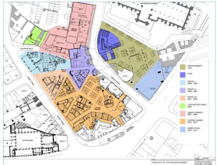
The regeneration of Borough Market, Ken Grieg, p33