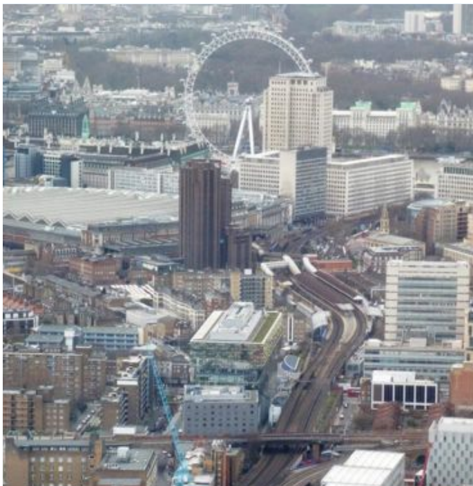
View from the Shard, Barney Stringer