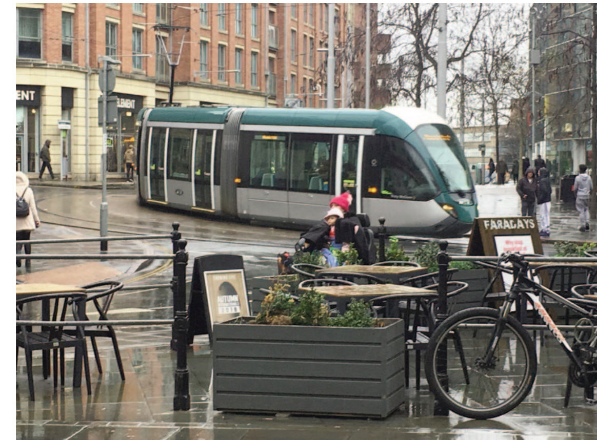
OPPOSITE: The Grenoble system with typical French features of an effective tramway development.