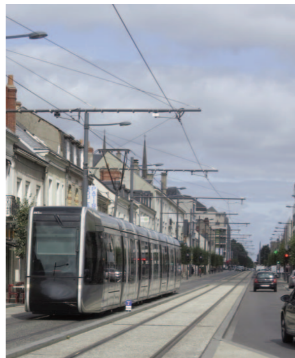
Reg Harman and Nicholas Falk, Swift Rail - Funding Local Rail Transit for Smarter Growth, Public Money and Management, September 2016

>>> European neighbours have the tools to do this; why can't we do so in the UK? We need to establish a broad appraisal system that assesses the benefits and impacts in a disciplined and cohesive fashion, with the WebTAG focus on forecast traffic levels forming one of several elements. 3. Development strategies must have clearly focused objectives of minimising car dependence through making it easier and attractive to use public transport and to walk and cycle as a basis for developing better neighbourhoods and towns. 4. Joint ventures to develop local transport systems should be set up between local authorities, public agencies such as development corporations or London and Continental Rail, and commercial partners. These need not be on the same basis for every city region. 5. Professional education and training should seek to produce an increasing cohort of people who are well versed in public transport modes and systems and in the relationships that transport has with economic and spatial development. 6. Government should act in the short term to identify some areas for regeneration or growth that could form pilot projects, finding stakeholders keen to support the approach. 7. Government must make the necessary legislative changes. These would include revisions to the NPPF to require coordination of spatial and transport planning and a new local transport act to allow genuinely integrated public transport.