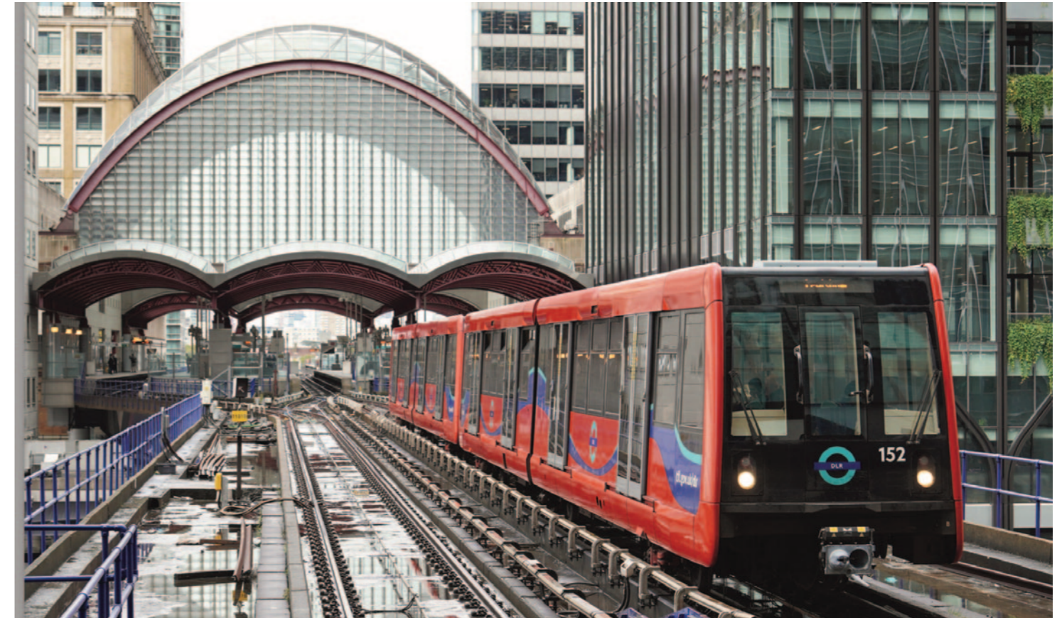
ABOVE: Docklands light railway

There is little point setting targets without overcoming the persistent obstacles, ranging from fractured and demoralised local authorities to a huge infrastructure deficit and a shortage of skilled people working in urban and strategic planning and in public and sustainable transport. There is little value in building