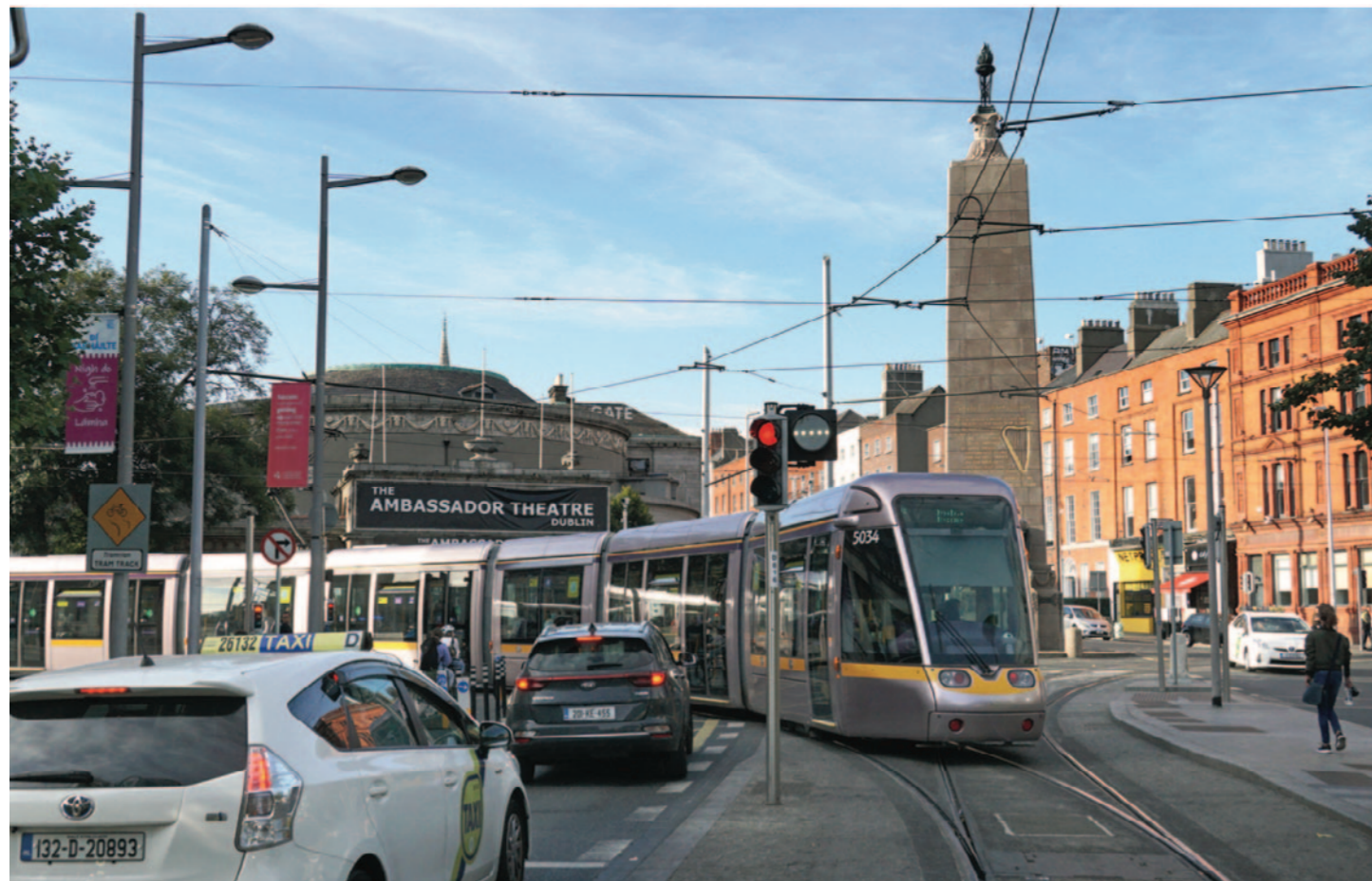
BELOW: Dublin's LUAS network, an ongoing success.

French city conurbations have seen their economies far outpacing the UK, not least through the enhancement of urban areas, largely based round giving the main streets over to public transport, especially tram lines. In Grenoble's case this has involved strong cooperation and interworking by the leaders of the city authorities, research centres and commercial undertakings. A network of five tramway lines links the city centre (with the main community and commercial establishments and housing areas on the edge. As these evolve, so too does the tramway. Many other French cities have since done the same, redesigning their principal streets around trams, bicycles and