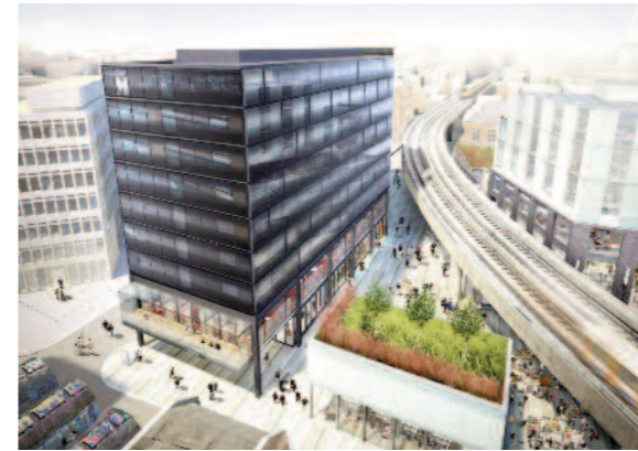
LEFT and below: Shoreditch Village: Up to nine storeys by Ellis Miller Architects

Shoreditch Village proposals look to make use of a site that is currently used as a car park and is bisected by a London Overground viaduct. Ellis Miller has won planning permission, listed building and conservation area consent from Hackney