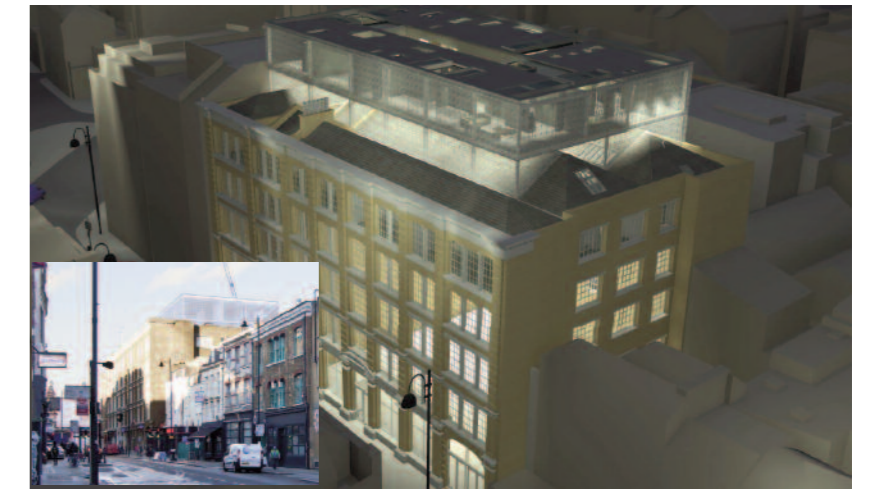
ABOVE: Rooftop developments within the conservation area