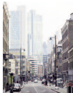
View down Curtain Road looking south with appeal site to left. This paper was prepared as part of a current planning appeal by BWCP relating to their scheme which includes a 'flying roof' above the listed Curtain House in Curtain Road, Shoreditch.