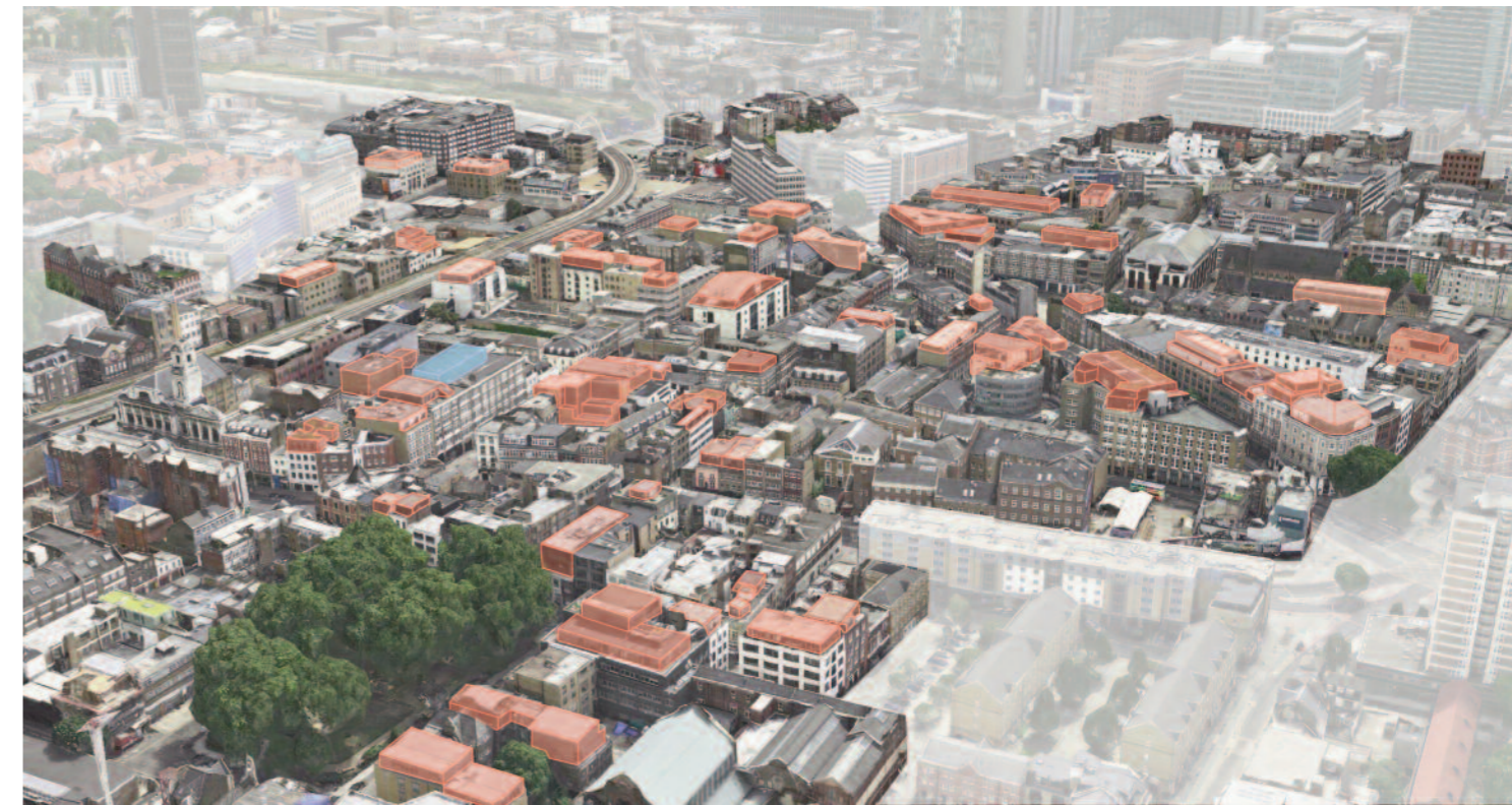
Building of Townscape Merit Planning application ref 2014/2701 granted

2-4 Paul Street [no image available] Description: Erection of 3rd & 4th floor extension for office use Applicant: Pearson Assoc. South Shoreditch Conservation Area Grade II Listed Planning application ref 2001/0672 granted