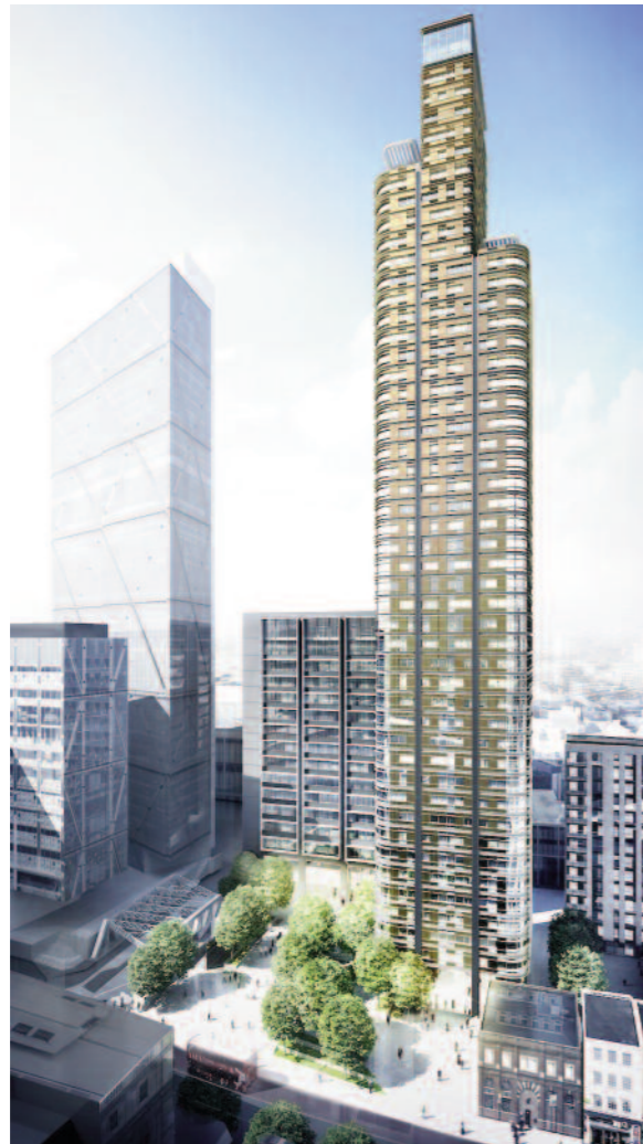
RIGHT: Principle Place: 50 storey residential and office tower by Brookfield and Concord Pacific

"The management approach towards South Shoreditch Conservation Area is to maintain a consistent scale and height of buildings within the Conservation Area boundary, and to support in principle taller developments beyond its boundaries