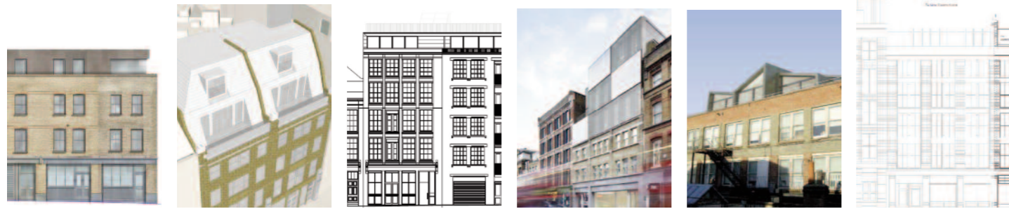
ABOVE: Examples cited in order as described in the text

We have selected some of the most recent rooftop permissions that have been granted within the Conservation Area. These represent a variety of listed buildings, buildings of townscape merit and also show solutions to rooftop developments which are quite varied in style and scale.