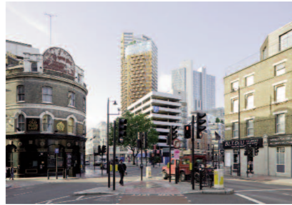
RIGHT: The Stage: 40 storey tower by Pringle Brandon Drew view from corner of Curtain Road and Great Eastern Street

Council for a 150,000 sq ft public realm and mixed-use project at the heart of London's creative quarter. This introduces a nine storey building into the local conservation area.