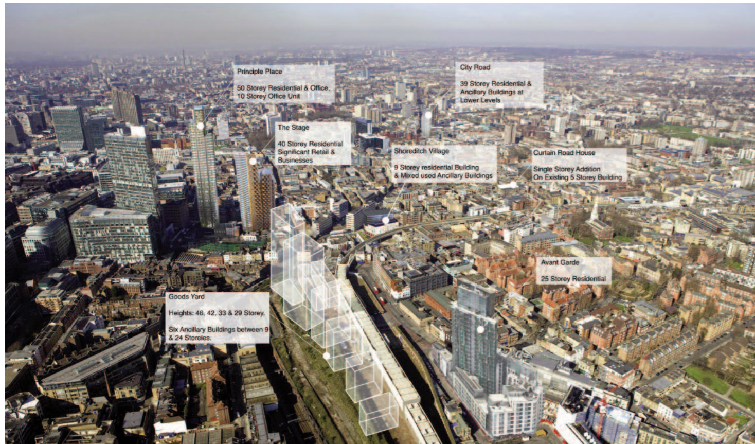
BELOW: Aerial view showing proposed developments

72 Great Eastern Street, London EC2A 3JL Description: 5th floor single residential unit roof extension Architect: Bowthorpe James LTD South Shoreditch Conservation Area