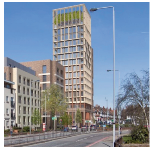
A visualisation of the proposals for the 17-storey tower in Purley

posed developments could "increase understanding of their impacts with planners and citizens during the design phase" and may allow communities to "understand and help shape development". ■