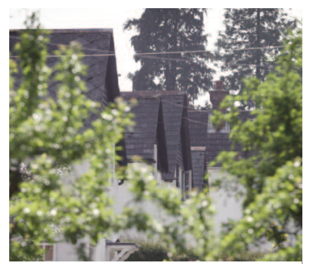
Letchworth Garden City

Although an abundance of space is notably absent from the Greater London area there remain opportunities to put the idea of new settlements into practice. It has been suggested that "more suburban development and urban extensions are needed to provide the family homes Londoners need".3 Equally, new settlements have been built within existing urban areas, such as Merchant City in Glasgow. The current development at King's Cross shows the scale of development possible even within a densely populated city. For a more radical solution to the housing crisis in the city, Boris Johnson's desire for a new town on the Heathrow site certainly doesn't lack ambi-