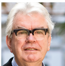
Sir Terry Farrell CBE