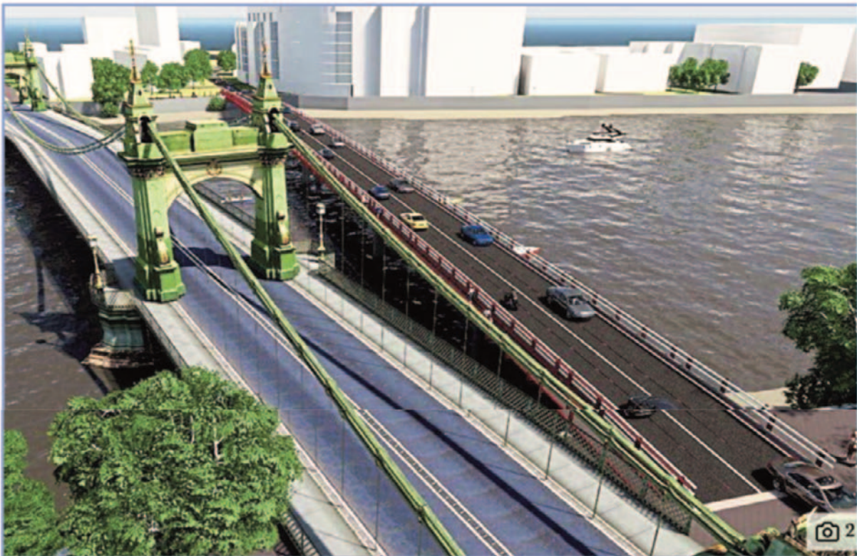
"Off the shelf": how the temporary structure would look ( )